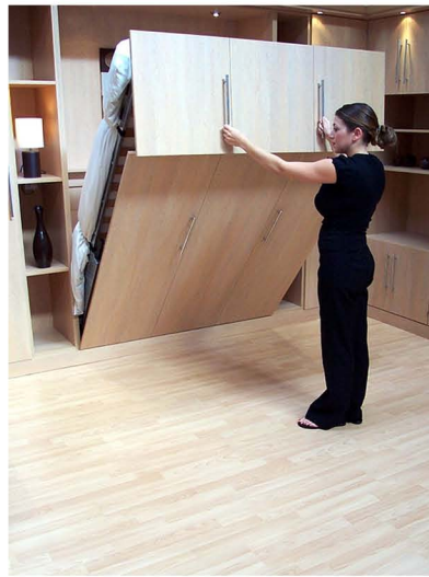
Hideaway System Double Bed