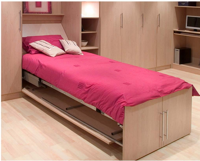
Hideaway System Single Bed

Hideaway beds can supply the wall bed frame & mechanism only or provide a complete furniture and wall bed solution.