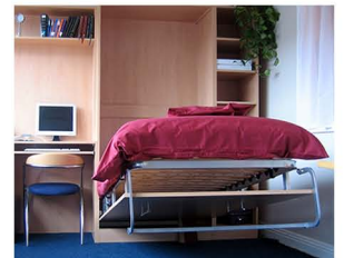
Foldaway System Single Bed