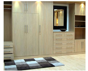
Hideaway System Single Bed